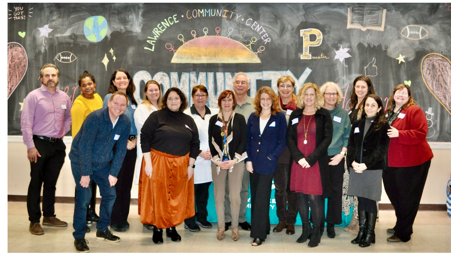
LTCF Fall Grant Award Recipients